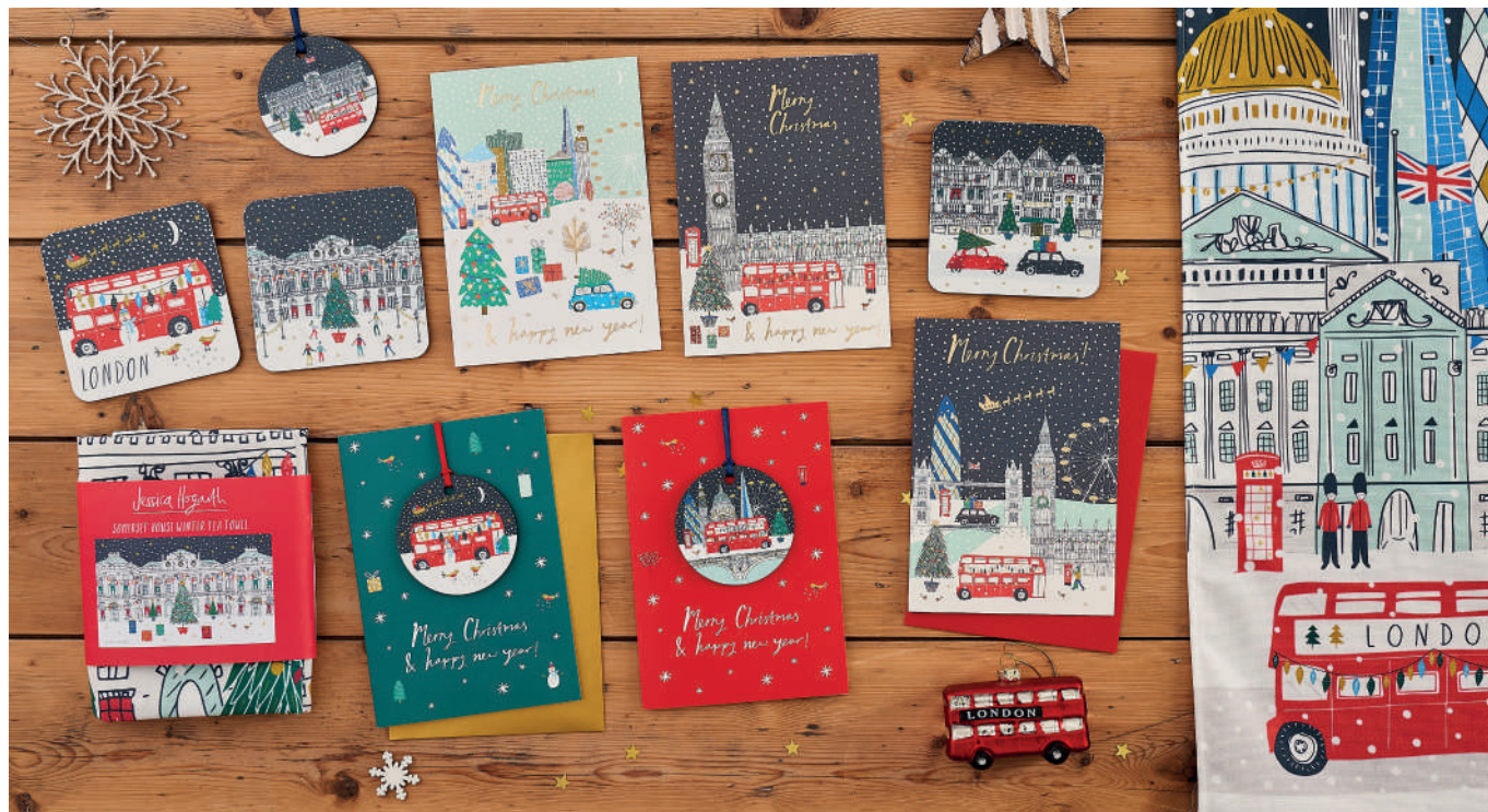
ILLUSTRATION & SURFACE PATTERN DESIGN