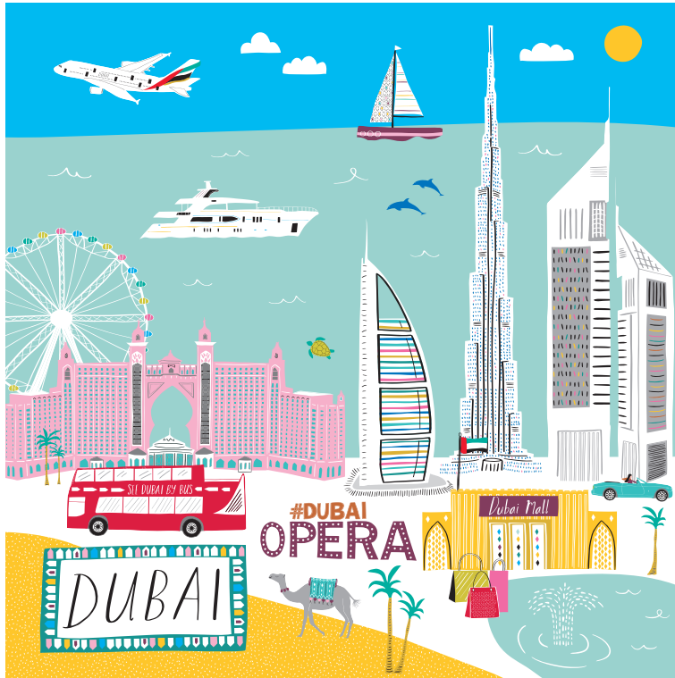
ILLUSTRATION & SURFACE PATTERN DESIGN