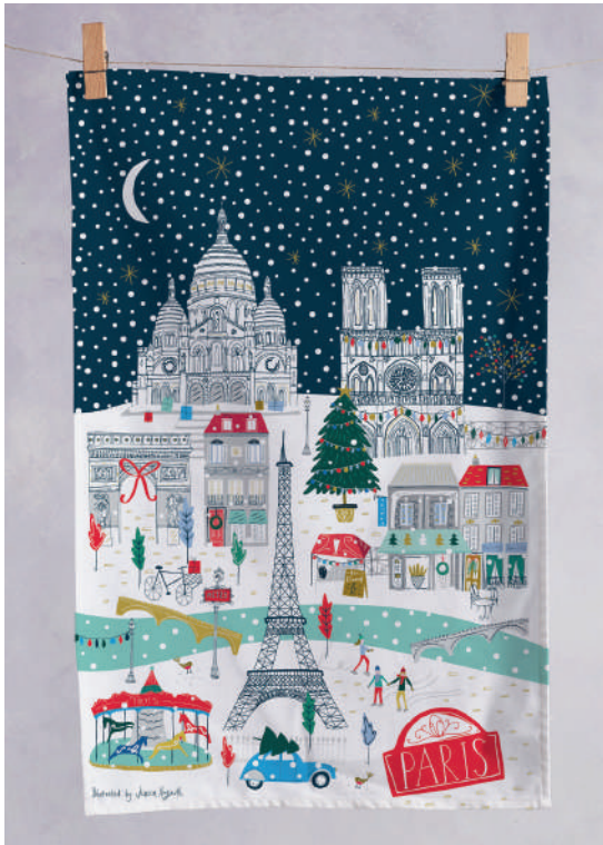
ILLUSTRATION & SURFACE PATTERN DESIGN