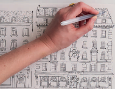
ILLUSTRATION & SURFACE PATTERN DESIGN