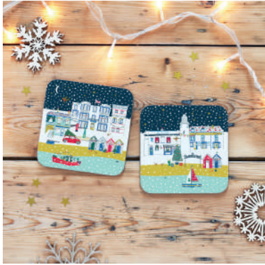
ILLUSTRATION & SURFACE PATTERN DESIGN